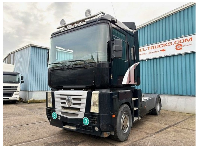
Renault Magnum 480 (E-TECH) PRIVILEGE (ZF16 MA... 4x2 Referentienummer: SN 55821500