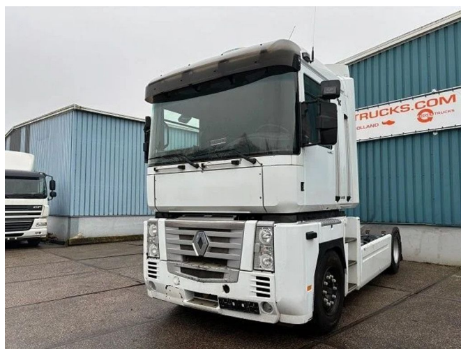
Renault Magnum 500 DXI PRIVILEGE (MANUAL GEA... 4x2