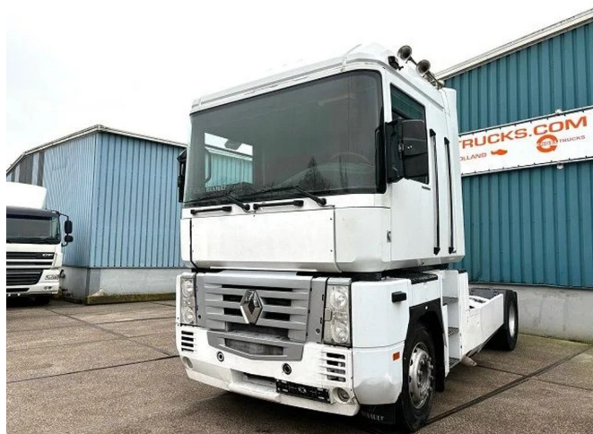
Renault Magnum AE 440 E-TECH (EURO 3 / ZF16 MA... 4x2