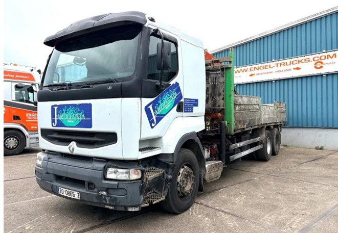
Renault Premium 385 .26G 6x2 PALFINGER / KIPPER (ME...