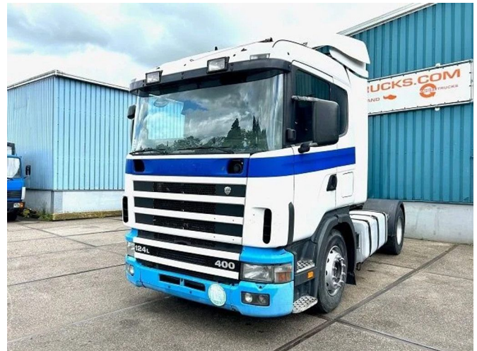
Scania R124-400 L 4x2 SLEEPERCAB ADR/VLG (2 FUEL LI... Referentienummer: SN 55248427