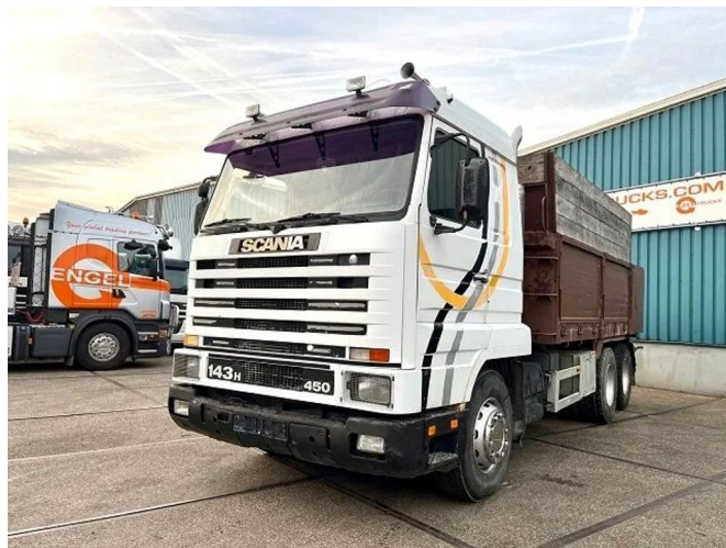
Scania R143-450 V8 STREAMLINE 6x2 FULL STEEL KIPPE...