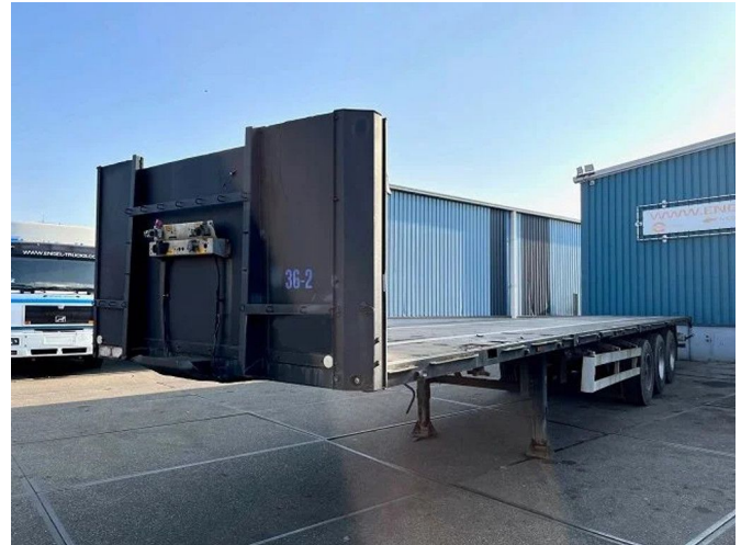
Van Hool 3B1047 13.60M. FLATBED TRAILER WITH 40FT ... Referentienummer: SN 51938877