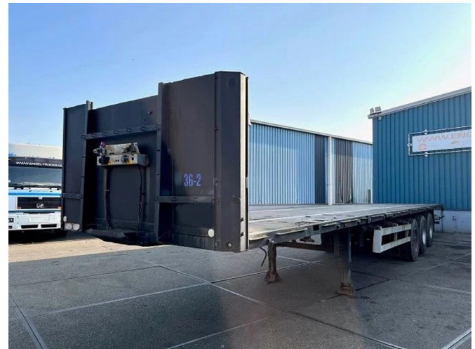
Van Hool 3B1047 13.60M. FLATBED TRAILER WITH 40FT ... Referentienummer: SN 51938877