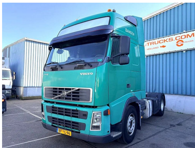
Volvo FH 440 GLOBETROTTER-XL (I-SHIFT / ENGINE... 4x2